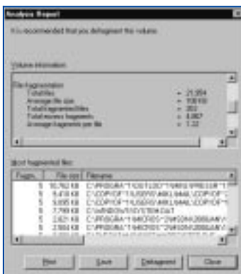
Figure 3 - Diskeeper's fragmentation report includes a list of the most fragmented files.

Disk Tune also has a priority setting. Its default value is "Responsive system", which means that other applications take priority over defragging. The Windows 95/98 version of Speed Disk does not have different priority settings and behaves like the built-in defragger in this respect.