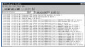
Figure 4 - A detailed defragging log.